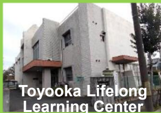
Toyooka Lifelong Learning Center

The second workshop (December 7th) will be held under the theme of "We hope the new facility and park will be like this," while the third workshop (February 15th) will be held under the theme of "Toward the development of the new facility."